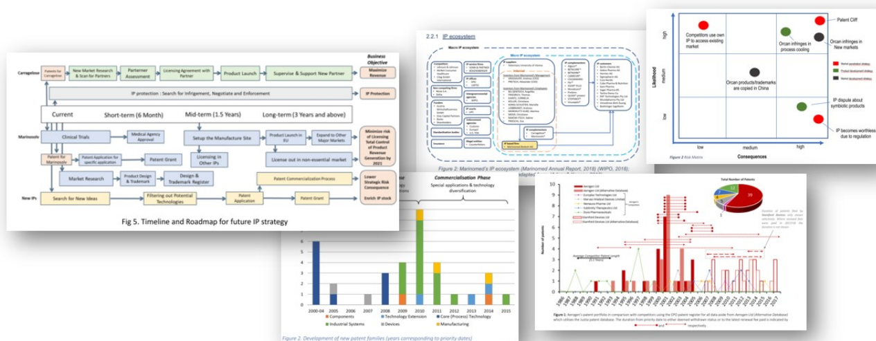
Note: Illustrations from previous student coursework reports.

The module builds on the state of the art in strategic IP management thinking for maximizing value appropriation from predominantly technological innovations and collaborative innovation processes. The module focuses on the management of formal IP rights (e.g. patents, trademarks, design rights, copyrights), but also covers the increasingly relevant informal IP (e.g. data/algorithms, know-how, trade secrets). The module particularly emphasises the way how companies use IP to contribute to the sustainable development goals (SDGs) and create sustainable impact, such as by developing green/ clean technologies (e.g. renewable energy, plastic alternatives, meat substitutes) or social impact (e.g. for job creation in low- and middle-income countries).